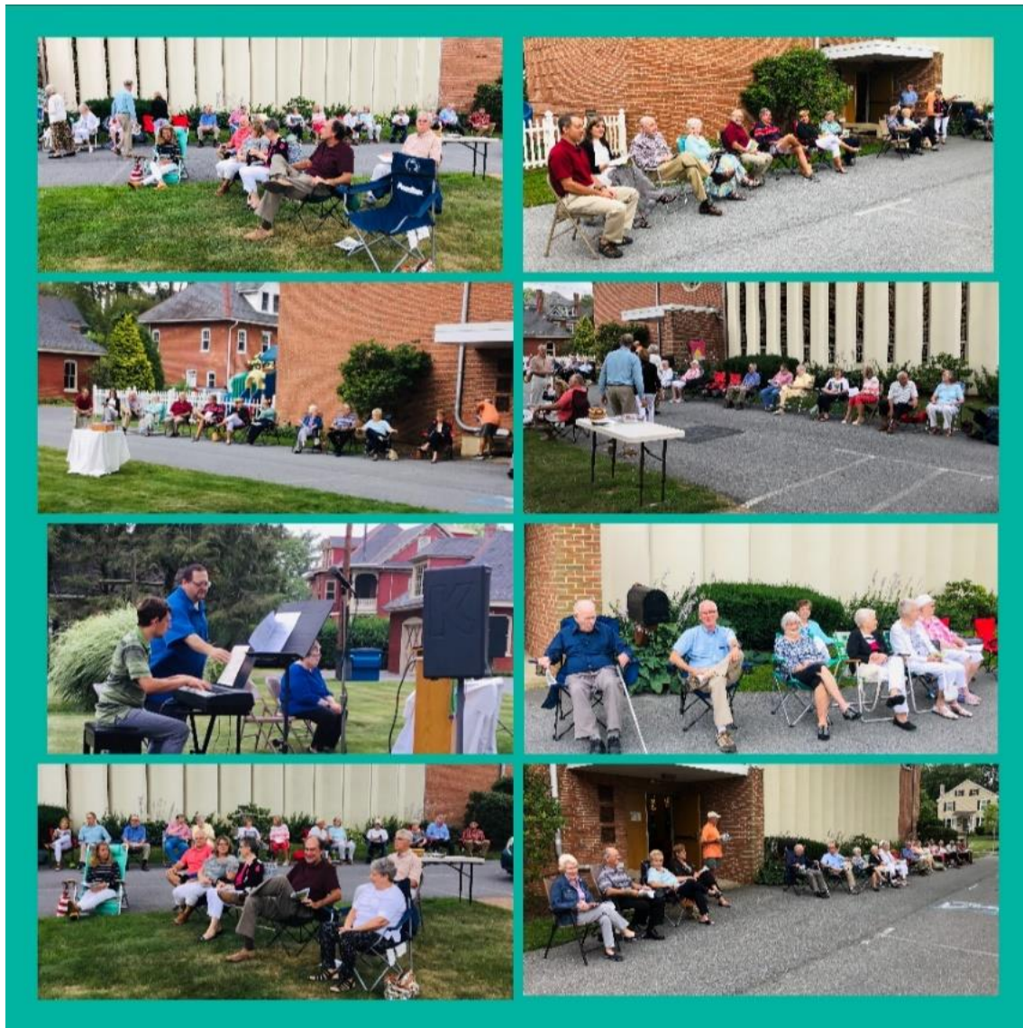
Outdoor Worship: August 1

The final summer outdoor service this season will be on Sunday, September 5 at 9:00 a.m. Worship outdoors has been a really wonderful opportunity for folks to not only be fed spiritually through the Word and music, but also through the fellowship with others while surrounded by God's beauty all around.