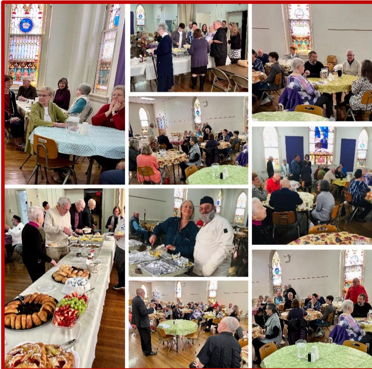
BRUNCH WITH THE BISHOP