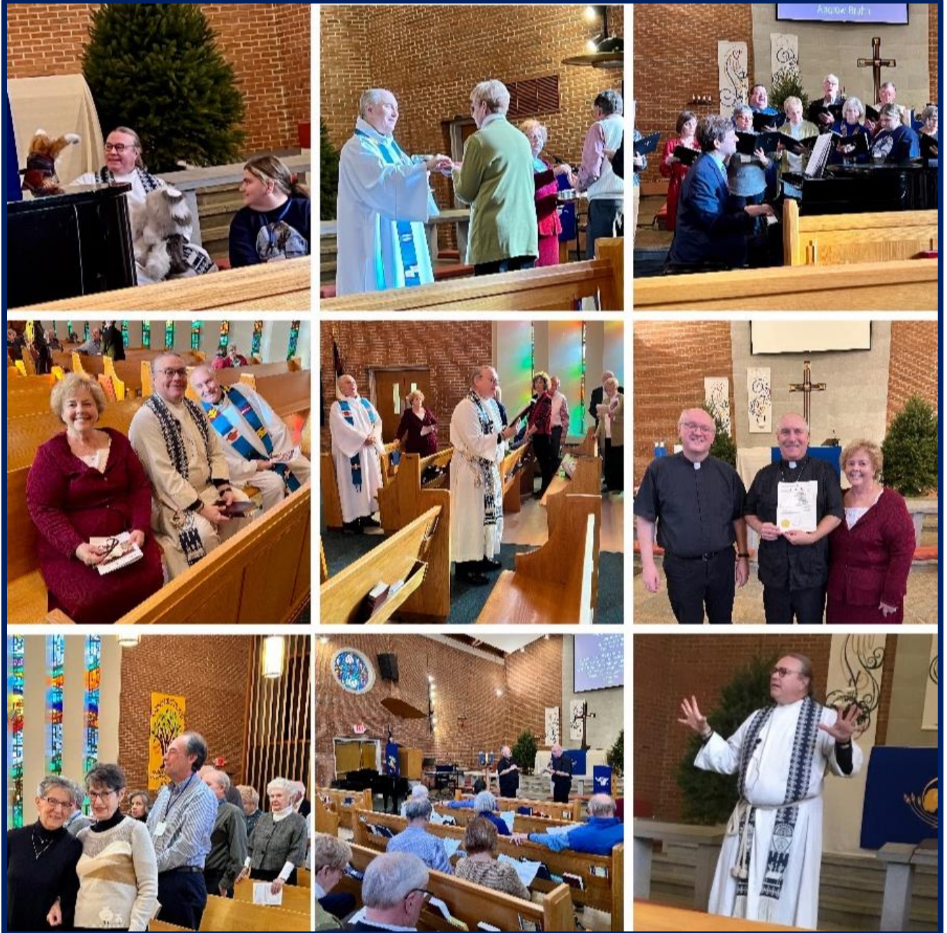
Morning Worship and Installation Service