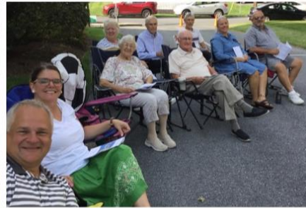
August 6 Outdoor Worship