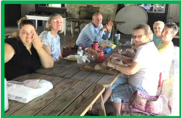
The July Picnic in the Park